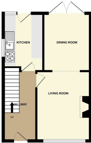
GROUND FLOOR 371 sq.ft. (34.5 sq.m.) approx.